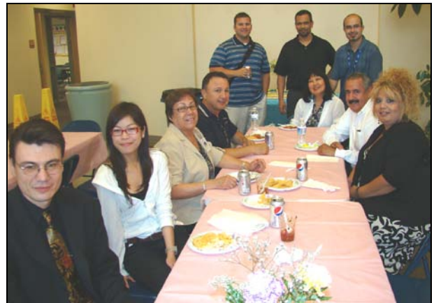
Staff at Rosemead center enjoying the delicious food from El Sombrero.

The Ramona and Rosemead Centers enjoyed food from El Sombrero Restaurant. The lunch/dinner included beef and cheese enchiladas, Mexican rice, beans, chips, and a drink. The food was delicious, and it was a good time for all staff to spend time together. We would like to thank all the classified and maintenance staff at both sites who worked so hard to make it enjoyable for the rest of us.